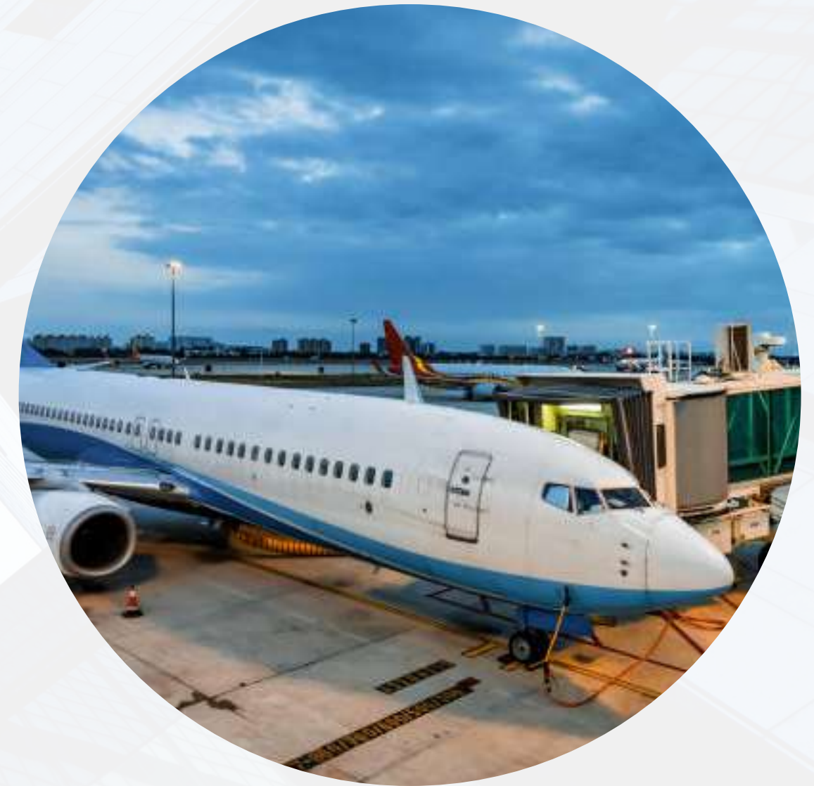
End to End Export Services