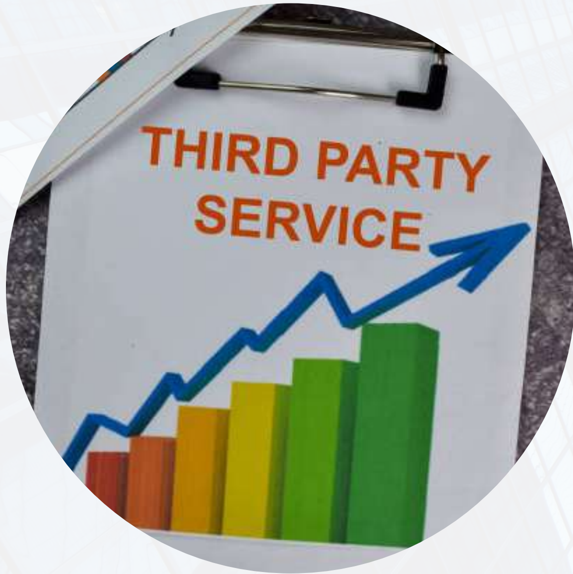
Third Party Imports