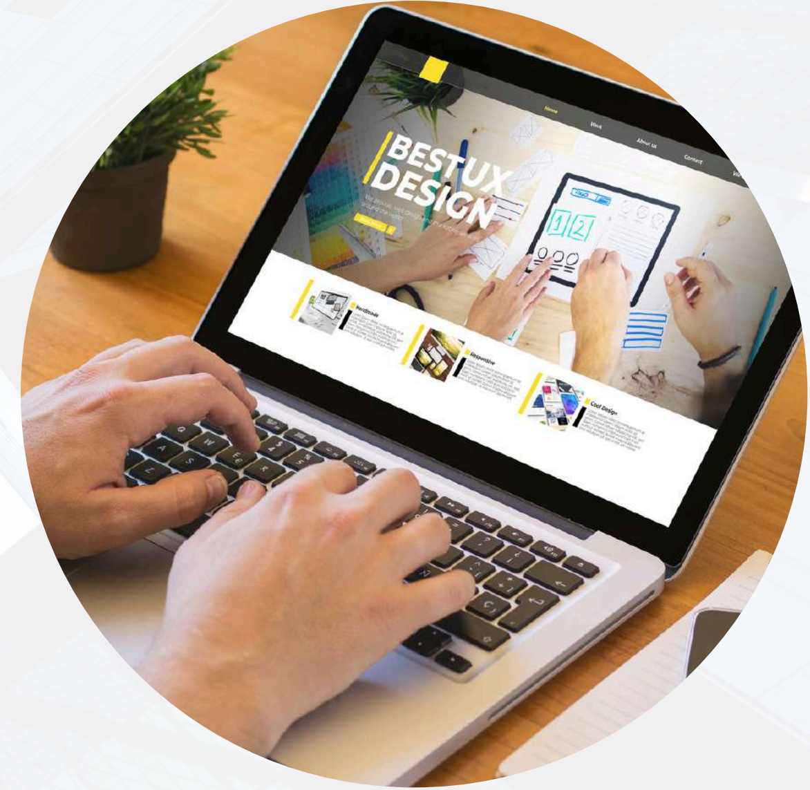
Website & Digital Marketing